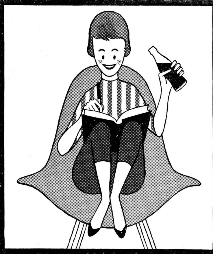
"COKE" IS A REGISTERED TRADE-MARK. COPYRIGHT 1958 THE COCA-COLA COMPANY.