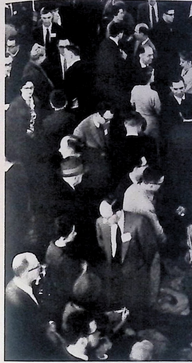
TEACHERS IN THE MARKETPLACE