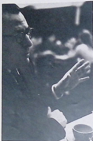
THE COLLEGE TEACHER: 1959