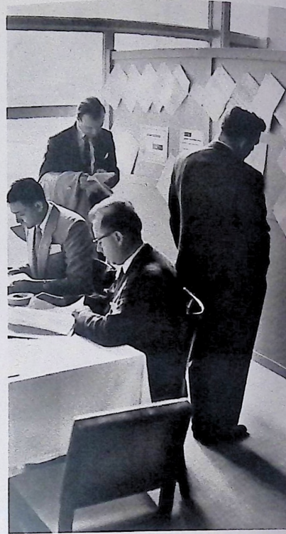
PEOPLE IN SHORT SUPPLY: