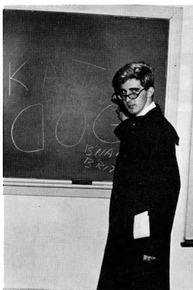
The recently-imported chairman of the College English department points out important concepts in the future of the English language.