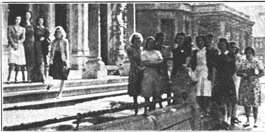
A "LUCKY 13"