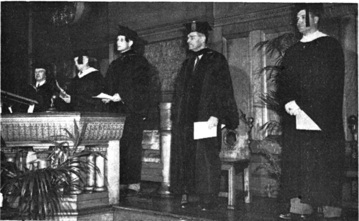
"... the college is serving the community itself."