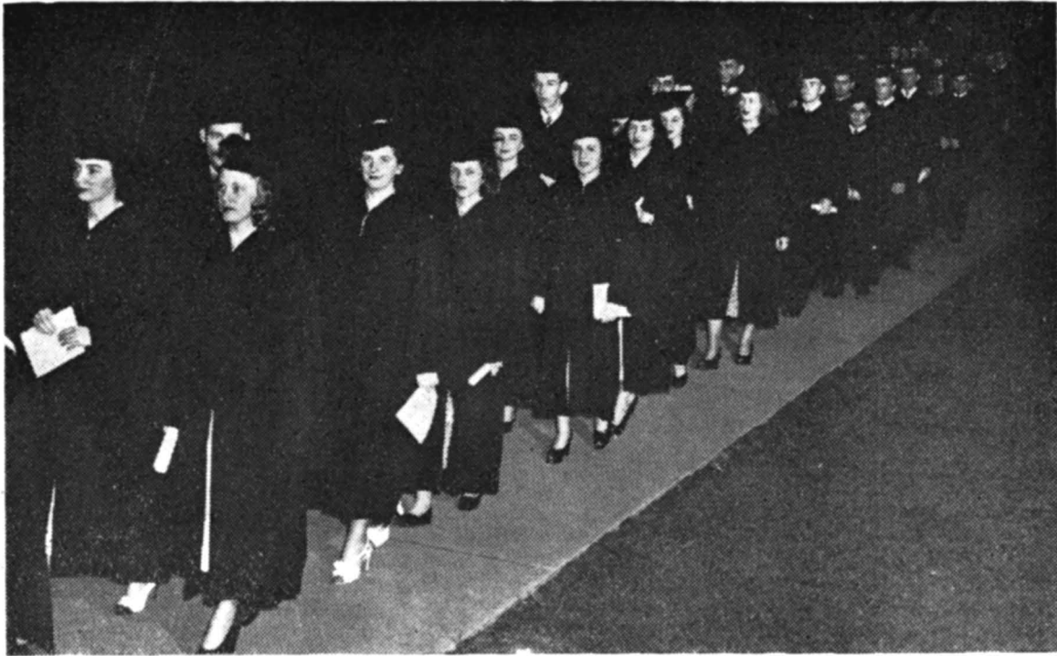
"... you might learn to endure it."