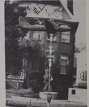
Winning most of the outdoor display honors was the Air Force ROTC detachment which had its plane revolving in front of its headquarters on South Franklin Street.