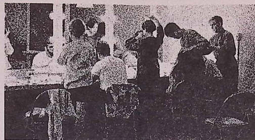
WILKES COLLEGE ARCHIVES Eugene Shedden Farley Library