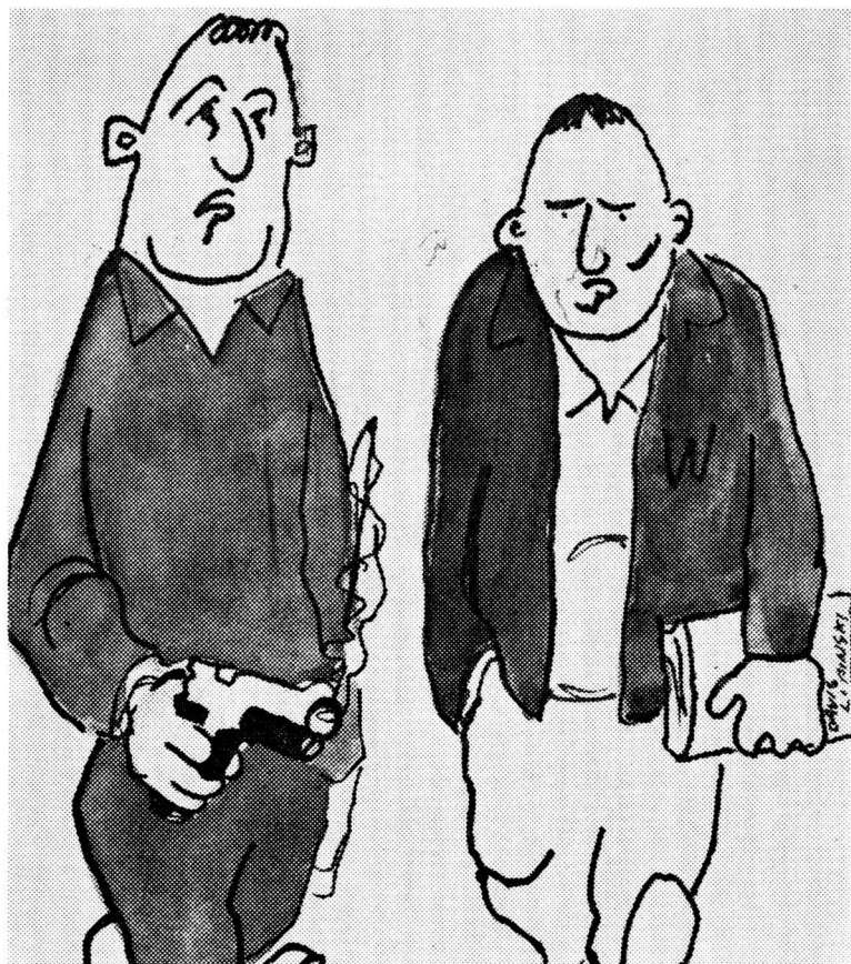
HE SAID THE ONLY WAY I WOULD PASS THE COURSE WAS OVER HIS DEAD BODY, SO ...

Fly for Zoes has been postponed until May 10.