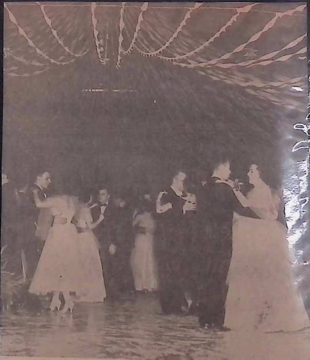
Guests danced amid the beautiful holiday decorations.