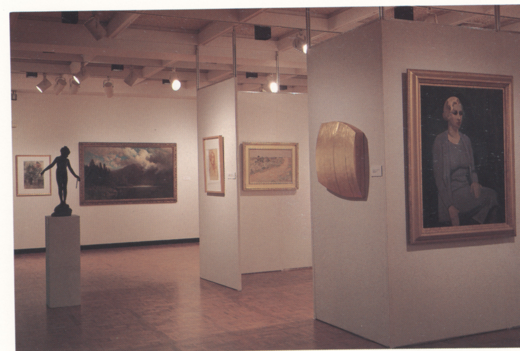
Installation view of the Twentieth Anniversary Exhibition: Sordoni Art Gallery Permanent Collection , May - July, 1993.