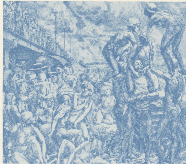
REGINALD MARSH (1898-1954) Coney Island Beach 1934 Etching 13" x 10 7/8" Museum of Art The Pennsylvania State University

This project has been funded by grants from the Pennsylvania Council for the Arts and the John Sloan Memorial Foundation.