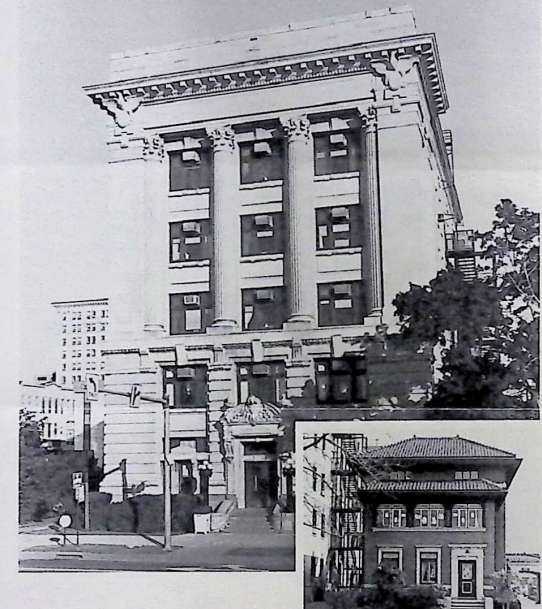
Stately Parrish Hall, once the home of such departments as Commerce and Finance, Political Science, Sociology, Psychology, and Education, and a landmark to motorists crossing the Market Street Bridge into the city, is in the process of changing hands, to be developed once again into a commercial office complex, along with Chapman Hall (insert).

Three buildings were determined to have outlived their usefulness to the College - Gore Hall and Dana Hall, both residence halls and both on South Franklin Street - have been razed along with Conyngham Hall Annex. The Gore and Dana Hall lots will be landscaped as "green areas" to open the vistas toward