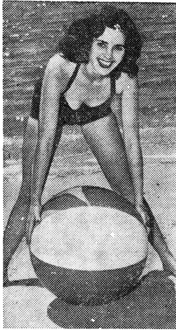
Come up and see me — at the Beacon Cabaret Party!