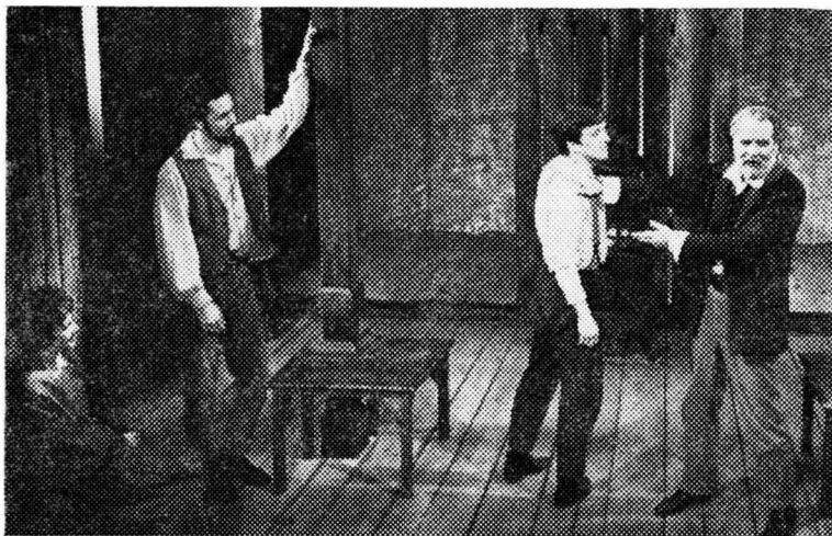
Featured players rehearse lines for "A Whitman Portrait."