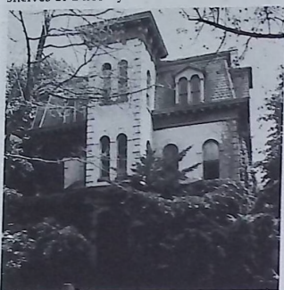
MINER HALL — A 105-year-old building, Miner Hall was recently razed on the Wilkes College campus. The stately mansion, at one time, was used as a women's dormitory and mathematics department.

The history of the campus buildings and the people who owned them are sometimes lost in the files of an old cabinet or on the shelves of a library.