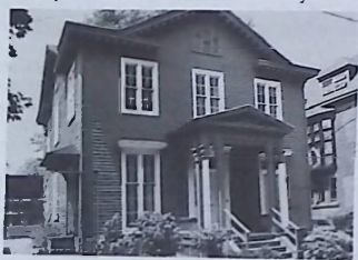
SLOCUM HALL — Named after Frances Slocum, the building at 115 South Franklin Street, also has been razed.

Numerous one-act plays were presented by the college Thespians, the Cue 'n Curtain Society, until 1965 when the Dorothy Dick-