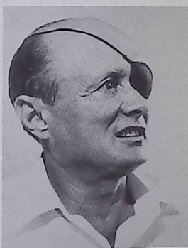
GENERAL MOSHE DYAN

Two performances, at 2 and 8 p.m., have been arranged for the Dec. 2 presentation of "1776." The Broadway musical won the Tony