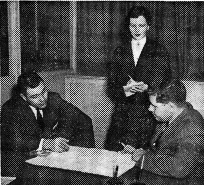
Discussing customers installation