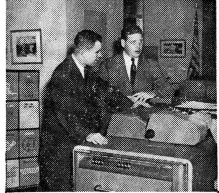
Checking out new client's system

IBM hopes this message will give you some idea of what it's like to be a salesman at IBM. There are equal opportunities for E.E.'s, I.E.'s, M.E.'s, physicists, mathematicians, and Liberal Arts majors in IBM's many divisions—Research, Product Development, Manufacturing En-