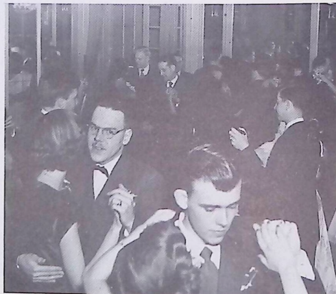
Note the happy expressions on these alumni! They're part of the record crowd that attended the annual Yuletide Ball. (See story).