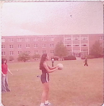
"E. Stroudsburg gets ready for the play" Members of E. Stroudsburg U. B. (E4)