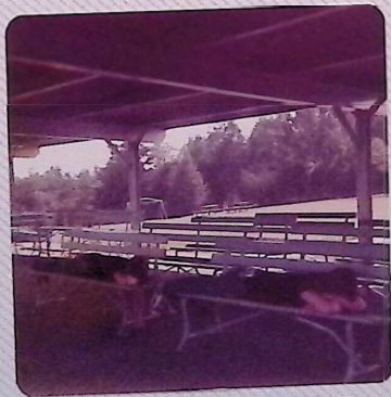
"Two rowdy boys at the picnic" (L-7)