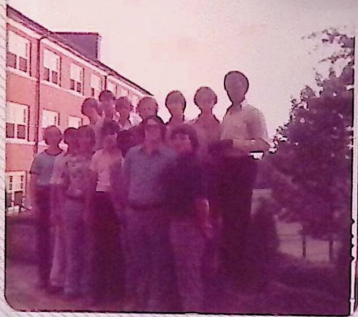
"The boys from their best angle"