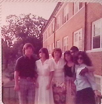
"Please send us to summer camp!"