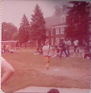
"Coming and going"