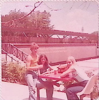
"Feeling Good" (G4)