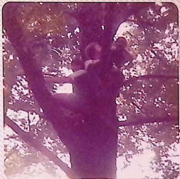
"Upward Bound finds its own roots"