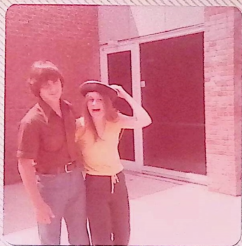
"There's nothing like a summer romance"