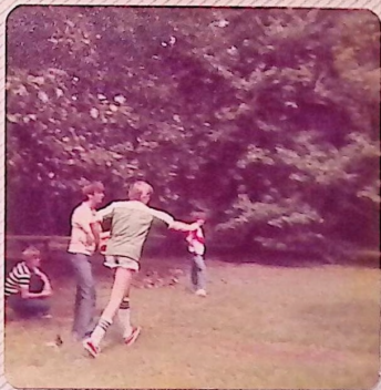
"The yard dash" (J-10)