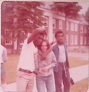
"She did it"