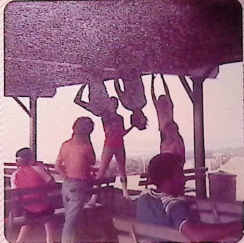
"Two Benders practice the bat hang"