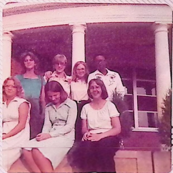
"Our future leaders"