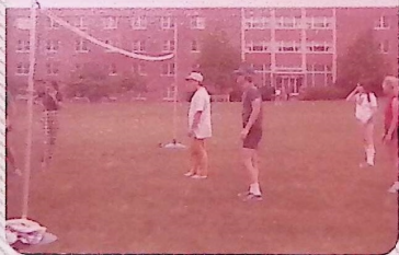
"C'mon C'mon C'mon"