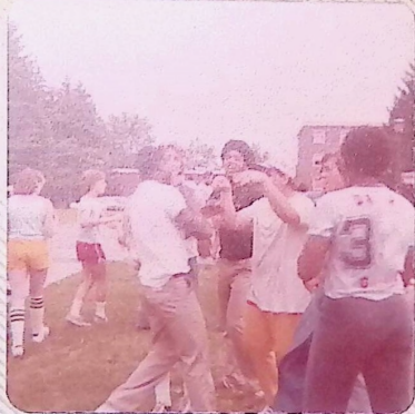
"Dissention on the team"