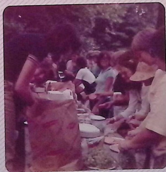
"A Hungrey Crew"