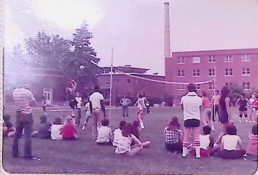
"Let's go Wilkes" (P7)