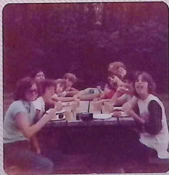
"The group indulges in chew - and - show"