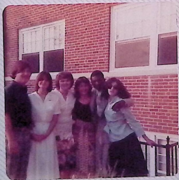
"Our professionally trained staff"