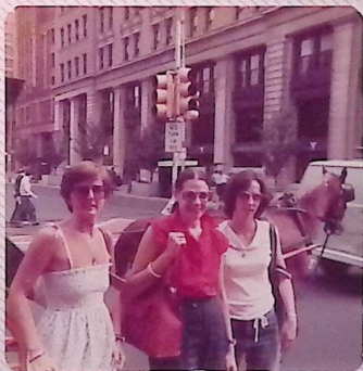
"Wow! The Big City"