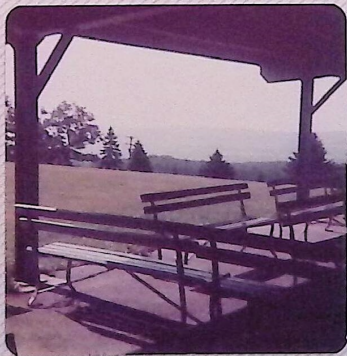
"What remains of Sam L. Lewis State Park" (L-9)