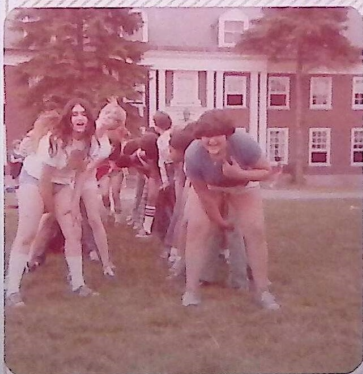
"Is anyone winning?" E. Stroudsburg & Wilkes Upward Bound (E13)