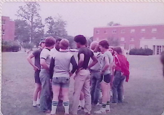
"Wilkes FUB in a huddle"