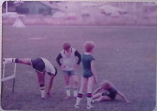
"The runners loosen up"