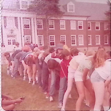
"Doing that E. Stroudsburg thing" E. Stroudsburg & Wilkes Upward Bound (E12)