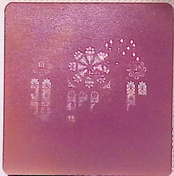
"Church window in Lancaster" (L-3)