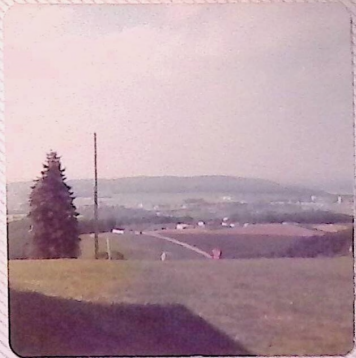
"Landscape of New D. Lewis State Park"