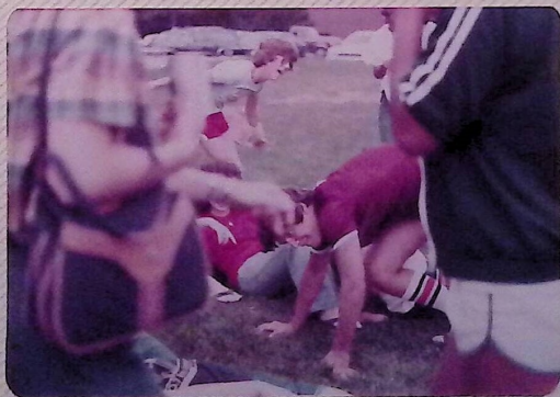
"Ya mean we got to start over again"?