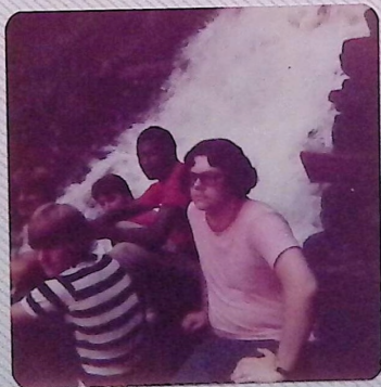
"The Flood Cometh"