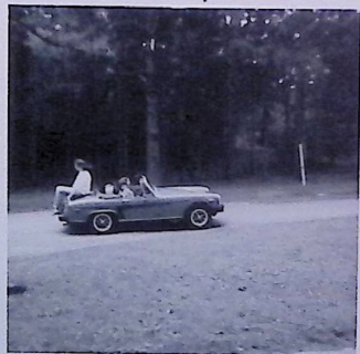
"The Company MGB"