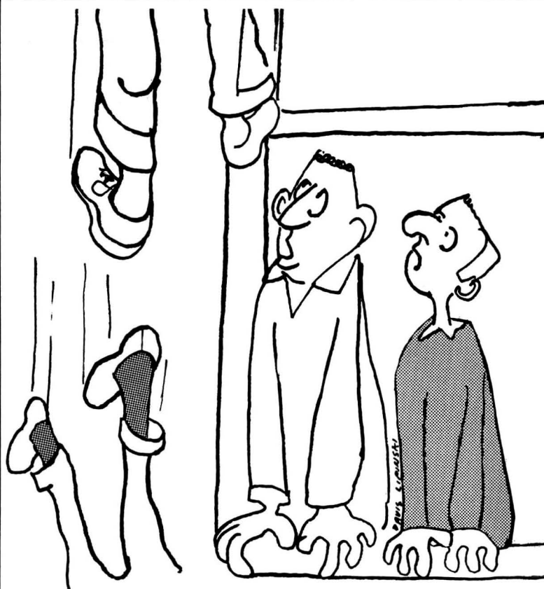
LOOKS LIKE THE BOYS UPSTAIRS GOT THEIR TESTS BACK.

All opinions expressed by columnists and special writers including letters to the editor are not necessarily those of this publication but those of the individuals.