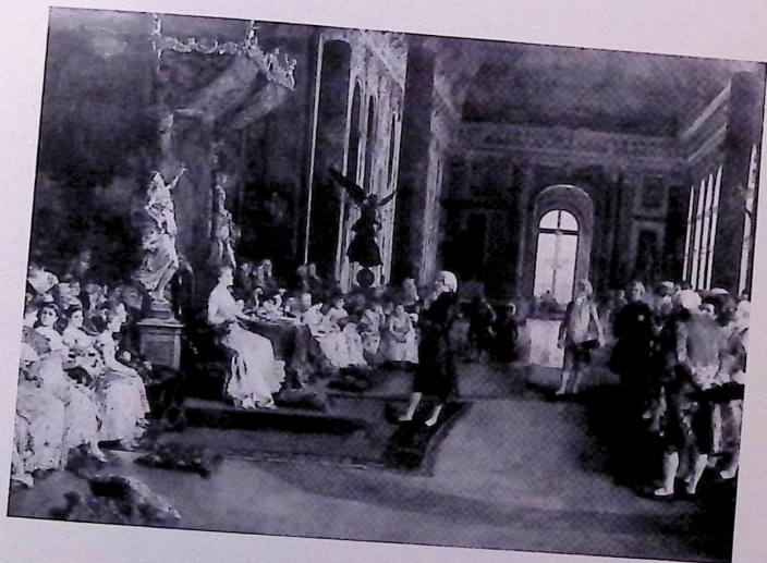
NEZ — Queen of the Floral Games