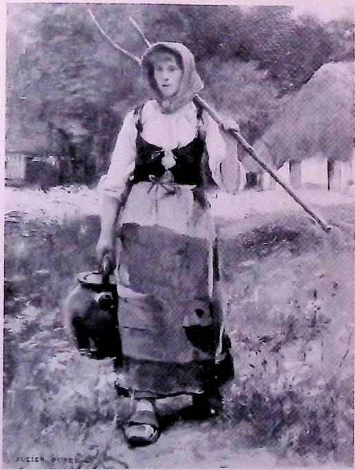
— Farmgirl, Rake and Water Jar