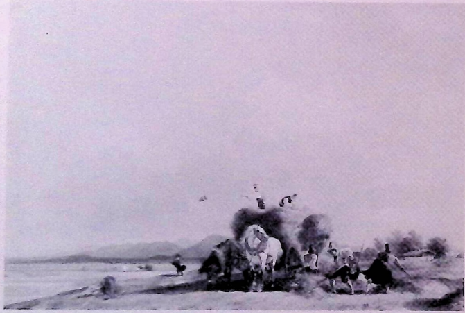
y Wagons and Storm Clouds