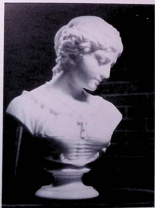
WOMAN, Classic hairdress