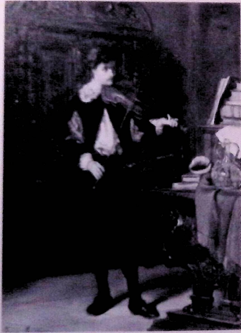
— Young Man Playing a Violin