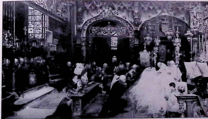
LEGOS — The First Communion