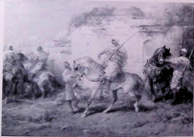
Dismounted Arabs by a Mosque