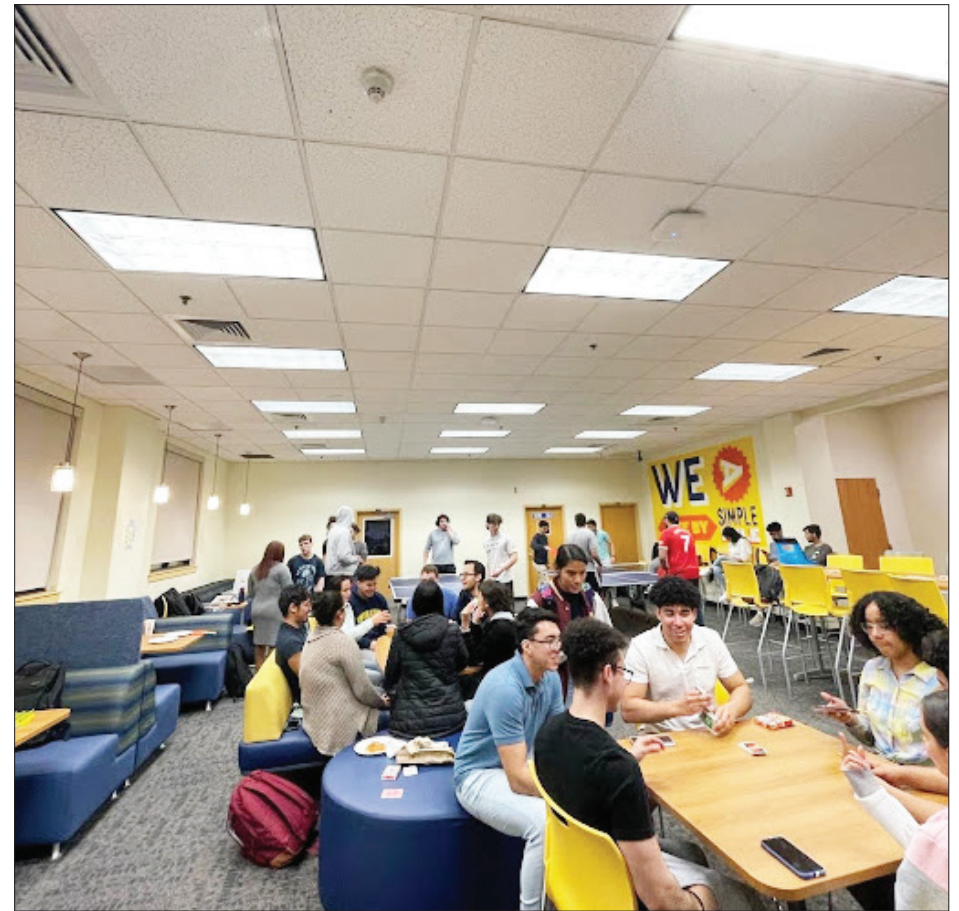
Though familiar now, the updated Student Union Building (SUB) lounge on the first floor is also a Student Government project.

"Although we primarily serve as an avenue of feedback for the food services, I can share something brand new this semester: the vending machine directly next to Which Wich on the first floor of the SUB, which offers a few additional food options," said Santini.