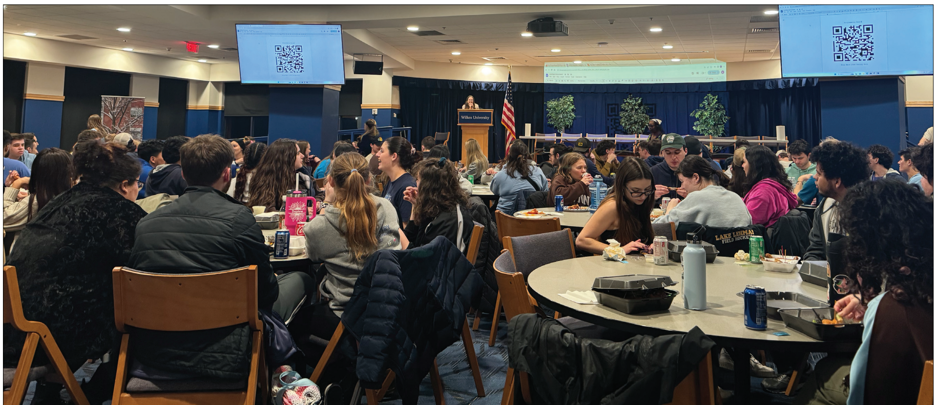
The event full of students who were eating wings at their tables, while figuring out the contestants for the hot wing contest.