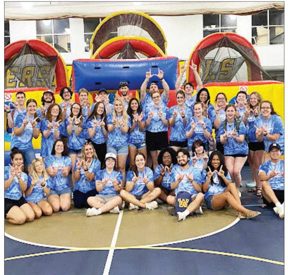
The 2023 Mentor cohort at the Colonel Carnival, one of the hallmarks of Welcome Weekend.

But why should students apply to be an e-Mentor?