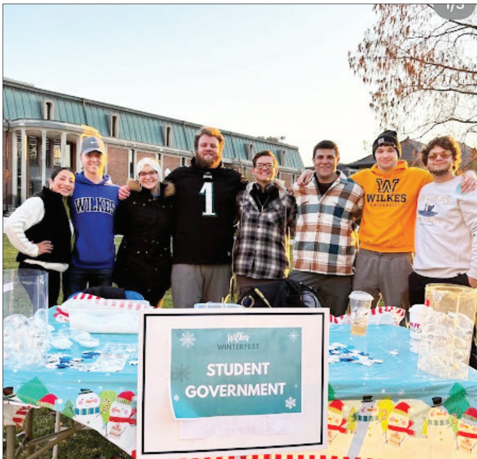
Student Government members at this year's Winterfest.

In addition to serving on committees, SG members sit in on weekly meetings.