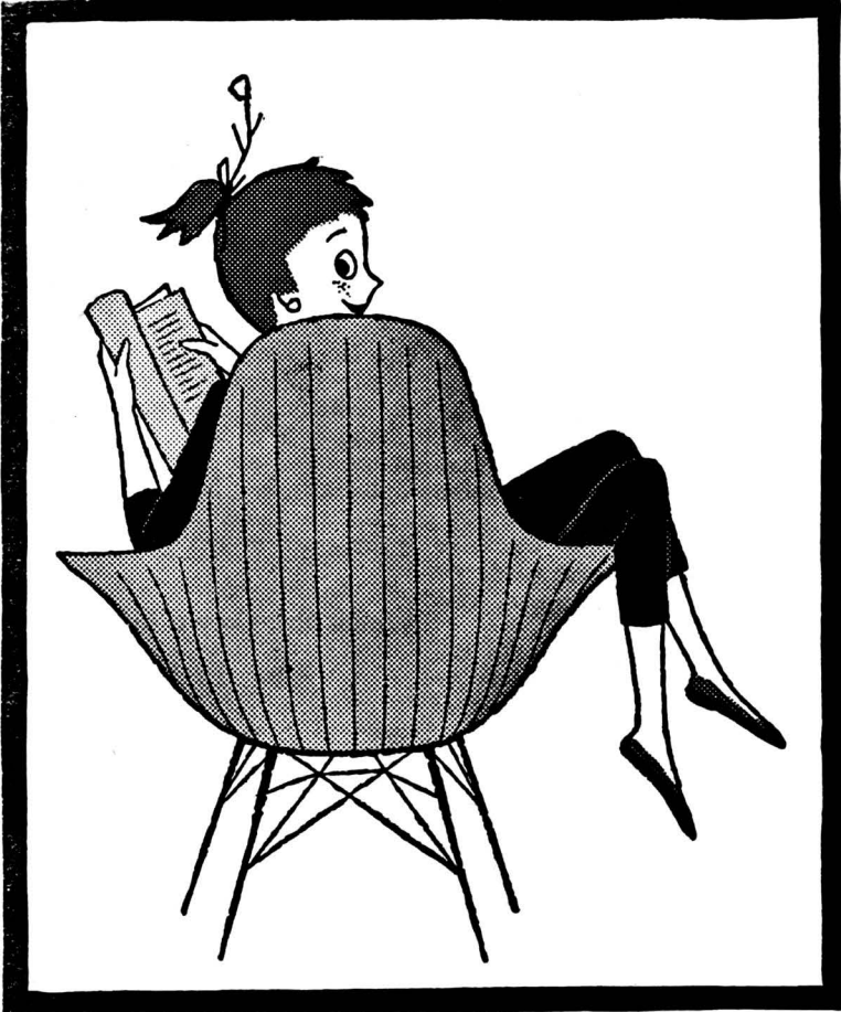
COPYRIGHT 1957 THE COCA-COLA COMPANY