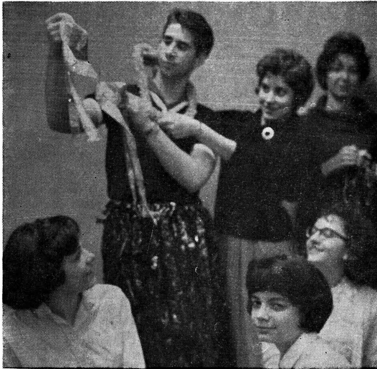
Shown above is a group of freshmen ardently preparing for tomorrow night's talent show in the gymnasium. "Frosh Gone Wild" starts at 8 p.m. and will be followed by a free dance.

The Human Rights Commission became bogged down with a debate over a semantic charge in one of its documents.