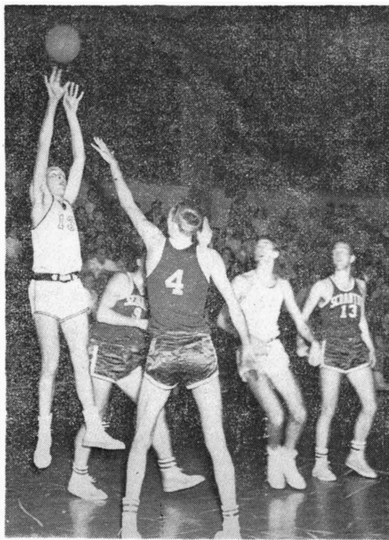
BEACON Photo by Cliff Brothers

Thomas entered the Wilkes Open Tournament this and won two matches before being defeated. The tourney featured some of the best grapplers in the collegiate circles.