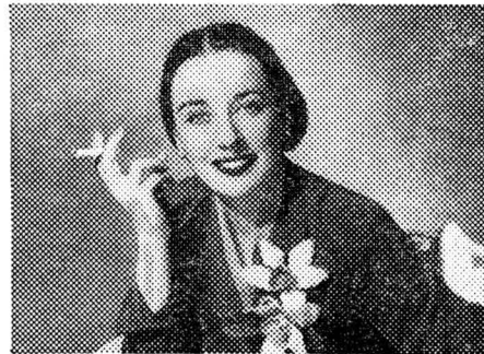
Patricia Morison, Musical Comedy Star: "I love L&M Filters. Never dreamed a filter cigarette could filter so thoroughly, yet taste so good!"