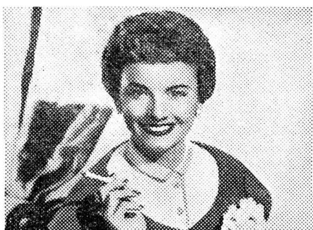
Janet Blair, Actress: "I have the fullest confidence in L&M's Miracle Tip ... and L&M's taste so good, I made them my regular cigarette."