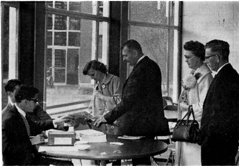
Parents register in the new dorm-cafeteria complex for the recent Parents' Day program.