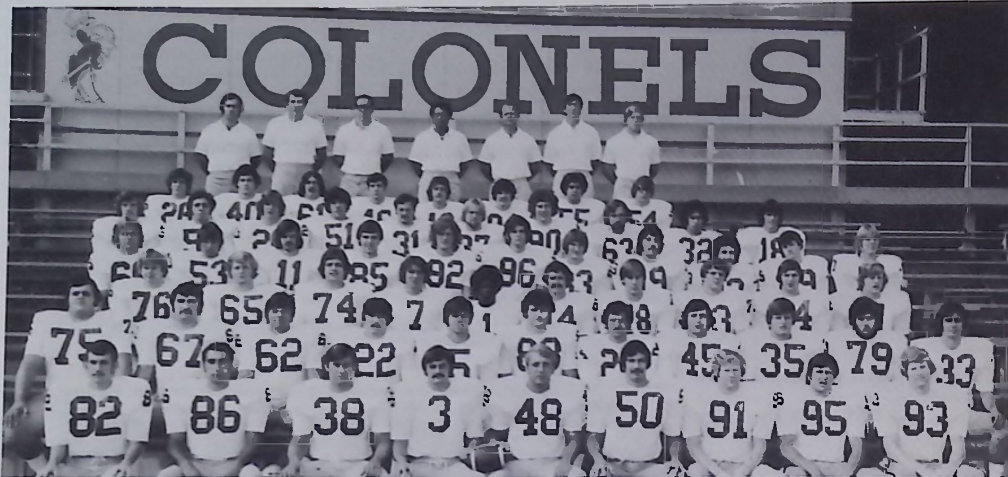
Hoping to gain their first Middle Atlantic Conference title in five years are the Wilkes College footballers, who enter their 29th varsity season on an air of confidence.