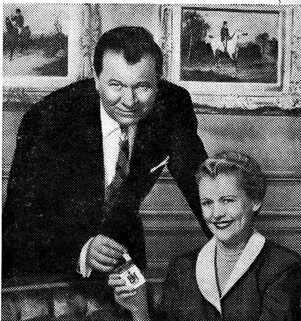
Mr. and Mrs. Stu Erwin, stars of TV's great "Stu Erwin Show": As we say on TV, this certainly is the Miracle Tip. L&M's filter beats 'em all.