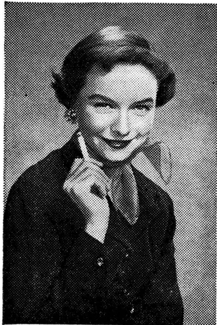
Actress Diana Lynn: This is the best filter of all—L&M's Miracle Tip. The smoke is mild, yet full of flavor.