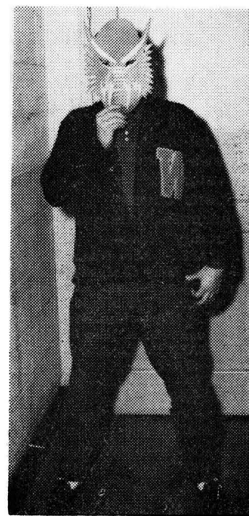
Masked Marvel returns to gorge himself at Cherry Tree Chop. (See story on page 6)

Fee for the entire trip is $5.00, which must be paid by next Wednesday. Anyone desiring to go should sign up on the bulletin board in Conyngham Annex. A deposit fee of a dollar is required in advance.