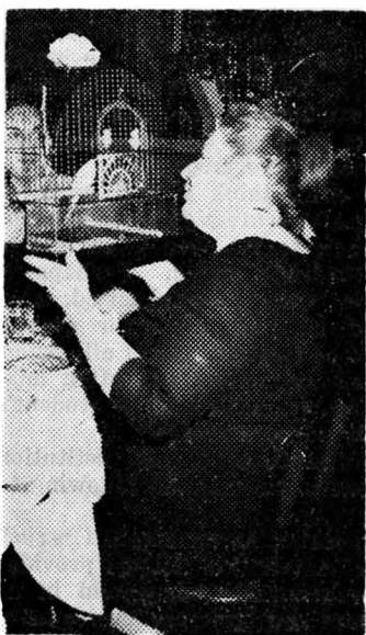
'Strictly for the Birds' (See story on page 4)