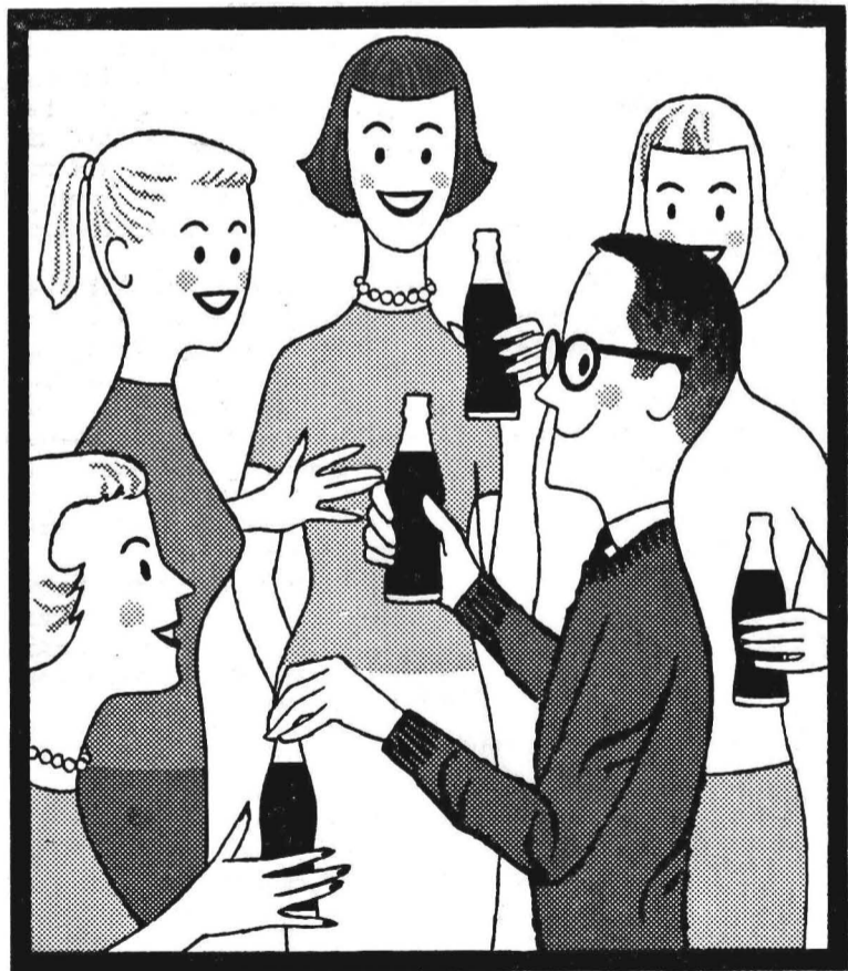
"COKE" IS A REGISTERED TRADE-MARK. COPYRIGHT 1958 THE COCA-COLA COMPANY.