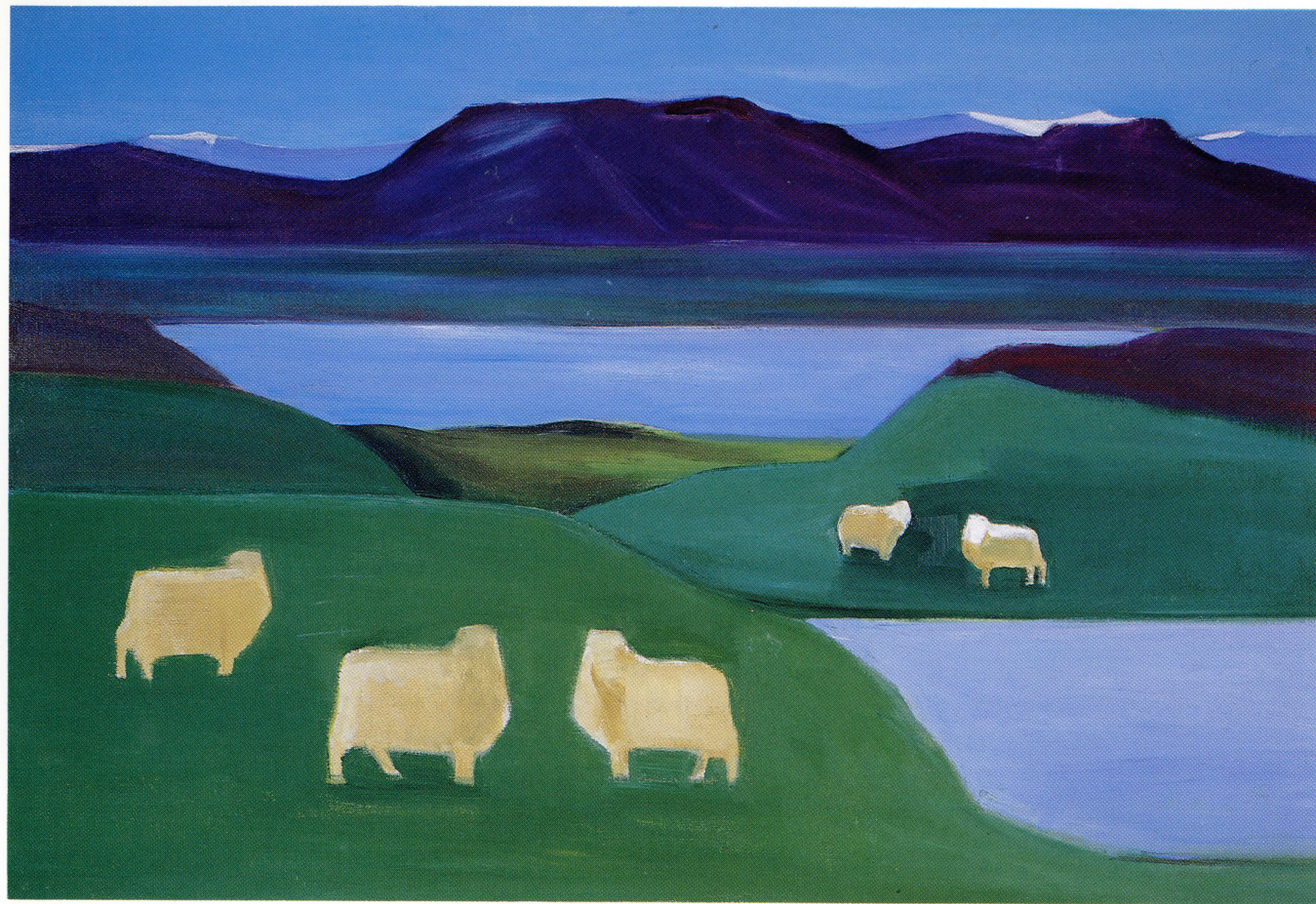
FIVE SHEEP oil on canvas 1990 42 x 62"